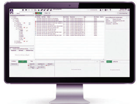
Alarm management enhancements