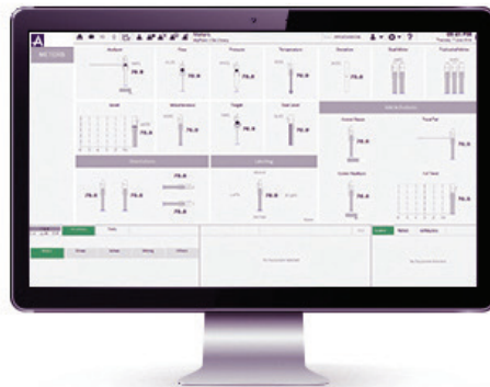
Library of configurable objects